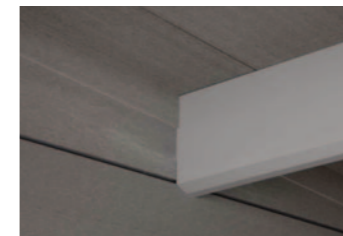
Aluminium support beams included for added structural strength.