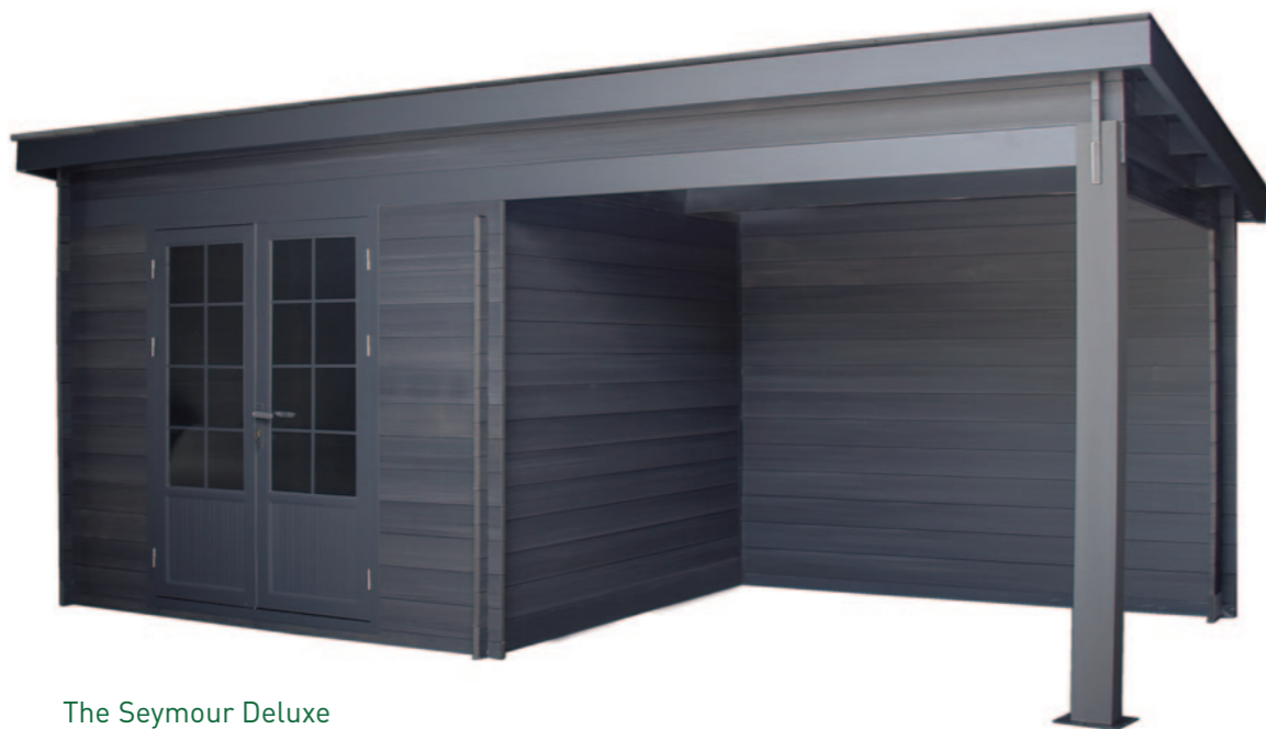
The Seymour Deluxe