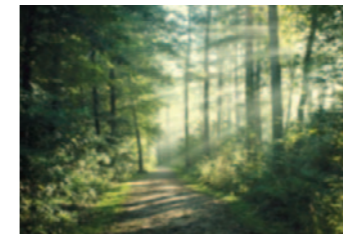
Made with recycled poplar hardwood.