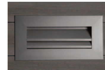
Aluminium air vents to prevent condensation build-up.