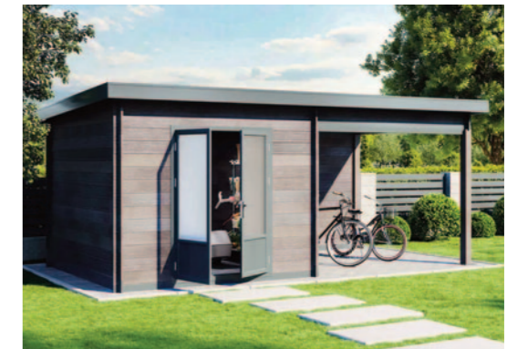
The Seymour Deluxe