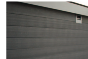
Outer Shell: Made using modified PE.